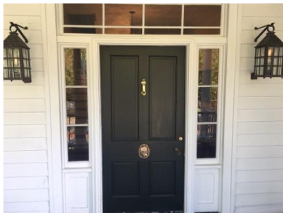
Private Residence that SRSC will schedule a Public Tour after the Annual Meeting

“Winnsboro is a small Revolutionary War town with several buildings still intact from that time period. The Cornwallis House Tea Company is named